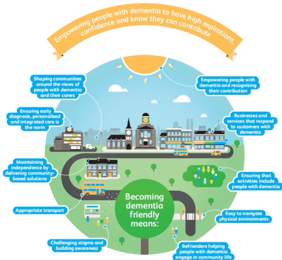
Figure 4.